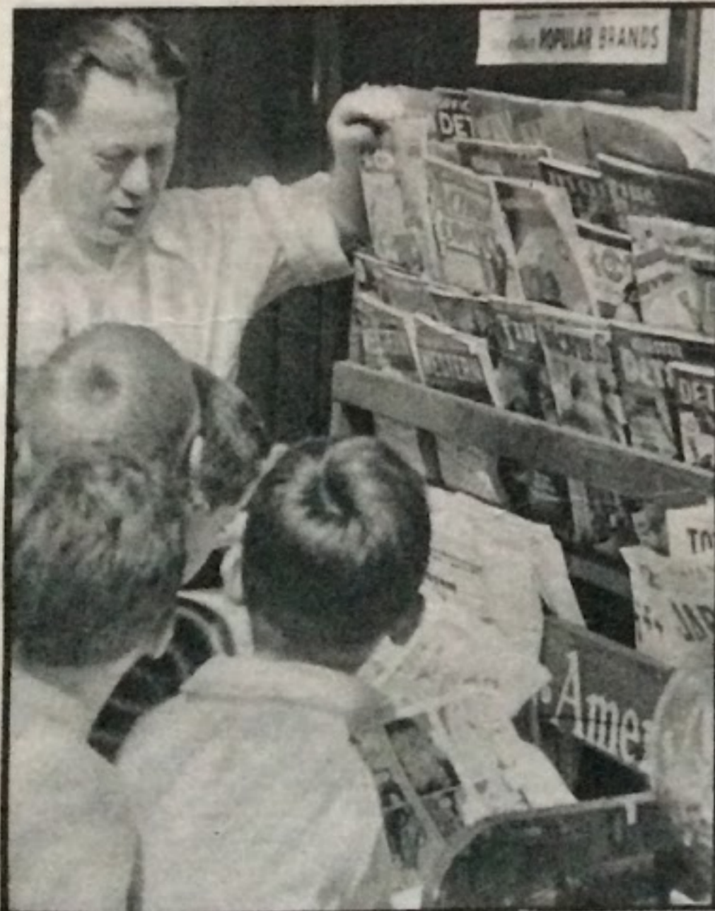
ACTION COMICS , with regular installments of Superman, leads the field of comic magazines (latest publishing sensation) with 600,000 copies a month, and Superman Quarterly sells a million. Newspaper syndication reaches 4,500,000 readers daily.